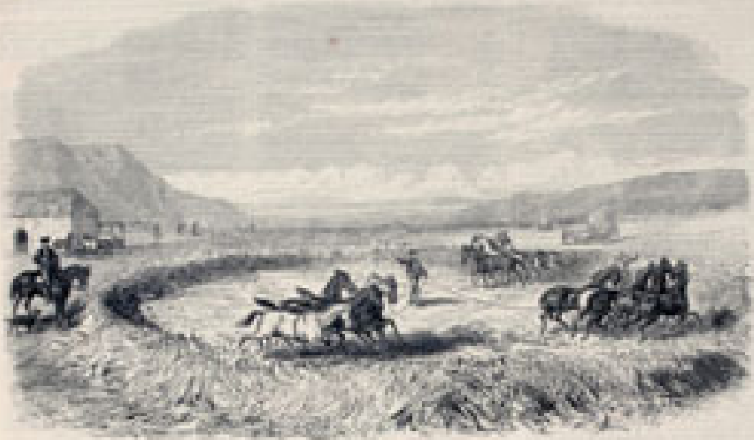
THE STRAFTING BUSINESS IN CHILE.

The illustration above depicts a scene of robbery and straitening in Chile. The men on horseback are engaged in a robbery, with some men on horseback and others on foot. The scene is set in a valley with mountains in the background.